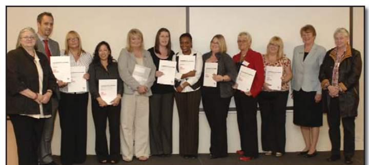
Presentation of Leadership and Management awards 2009