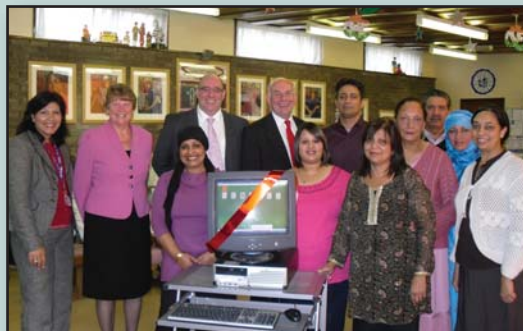
Shakti Day Centre launch

Effective teamwork and partnership working made this activity possible. Congratulations to the staff involved, and to those who contributed in raising extra funding to support the computer initiative.