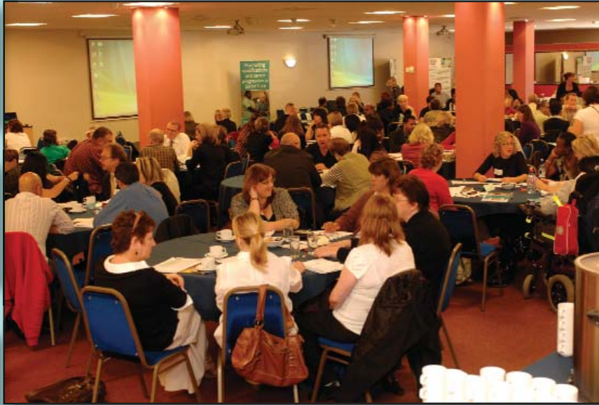
Group discussion at the Care Provider meeting